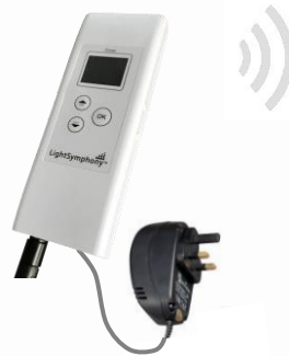
Part No. LS30900WIFI