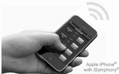
Apple iPhone® with iSymphony®