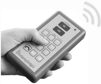
Part No. LS30050WRC