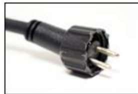
Male 2 Pin Plug & Play Adaptor (supplied)