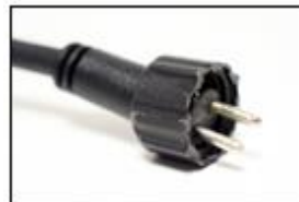
Male 2 Pin Plug & Play Adaptor (supplied)